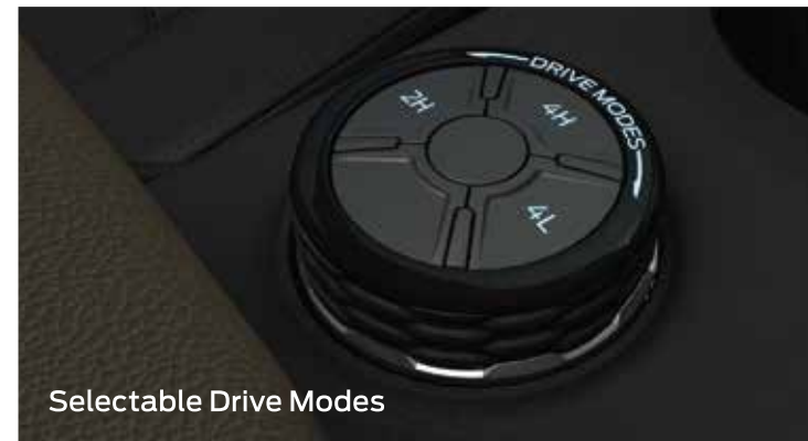
Selectable Drive Modes

With 800mm water wading capability, the Next-Gen Everest comes prepared for the rainy season.